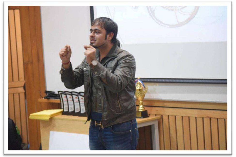
CLICK HERE TO WATCH THE VIDEO