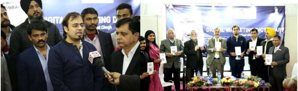
CLICK HERE TO GET BOOK FROM AMAZON